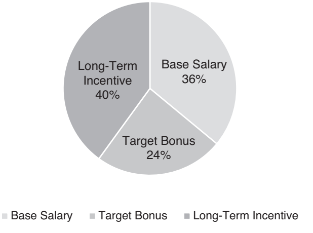
Fiscal 2018 Target Compensation

Each element of compensation is designed to achieve a specific purpose and to contribute to a total package that is competitive, appropriately performance-based and valued by the Company's executives. The Compensation Committee reviews information provided by Total Rewards Strategies and the Company's historical pay practices to determine the appropriate level and mix of compensation. In allocating compensation among elements, the Company believes the compensation of the Company's most senior executives, including the Named Executive Officers, who have the greatest ability to influence Company performance, should be predominately performance-based. As a result of this strategy, 64% of the Named Executive Officers' total target compensation, including the Chief Executive Officer's compensation, was allocated to performance-based pay in fiscal 2018.