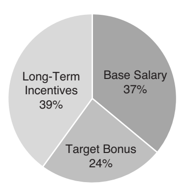
Fiscal 2019 Target Compensation

Each element of compensation is designed to achieve a specific purpose and to contribute to a total package that is competitive, appropriately performance-based and valued by the Company's executives. The Compensation Committee reviews information provided by Total Rewards Strategies and the Company's historical pay practices to determine the appropriate level and mix of compensation. In allocating compensation among elements, the Company believes the compensation of the Company's most senior executives, including the Named Executive Officers, who have the greatest ability to influence Company performance, should be predominately performance-based. As a result of this strategy, 63% of the Named Executive Officers' total target compensation, including the Chief Executive Officer's compensation, was allocated to performance-based pay in fiscal 2019.