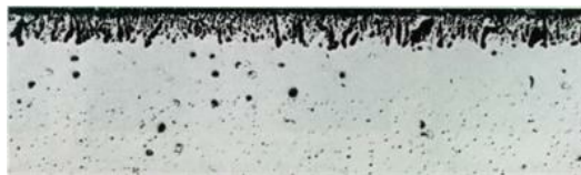
INCONEL alloy 601 Average Metal Affected = 5.3 mils (135 μm)