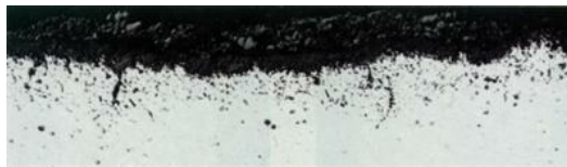
Alloy 800H Average Metal Affected = 8.9 mils (226 μm)